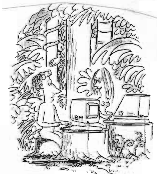
"Oh, come on, try the Apple"